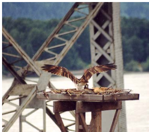
The Port's osprey nest provides a lofty home.

Port is appreciated by staff, who take pride each year in watching the beginnings of another cycle of life.