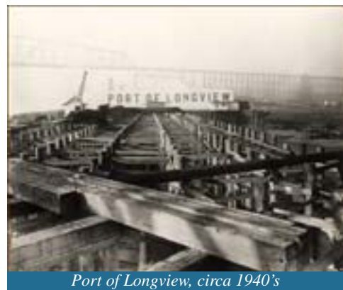
Port of Longview, circa 1940's

Port staff have been busy re-searching the Port of Longview's history for the website. In doing so, they discovered that the Port of Longview was originally established as the Port of Kelso!