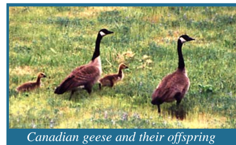
Canadian geese and their offspring

For several years, Port staff have observed a few pair of Canadian geese returning to lay their eggs at the water's edge. This spring, staff were again able to watch the new baby goslings change from fluffy balls of feathers to graceful adults.