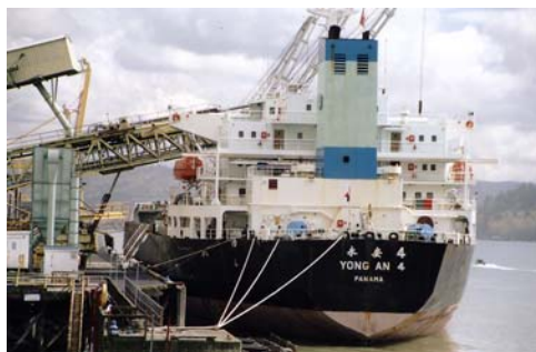
Yong An 4 at the BP facility

The Port's docks have been busy this spring with significant cargo activity, increasing tonnage and keeping local longshore workers busy. At Berth 5, two records were set in April: one for