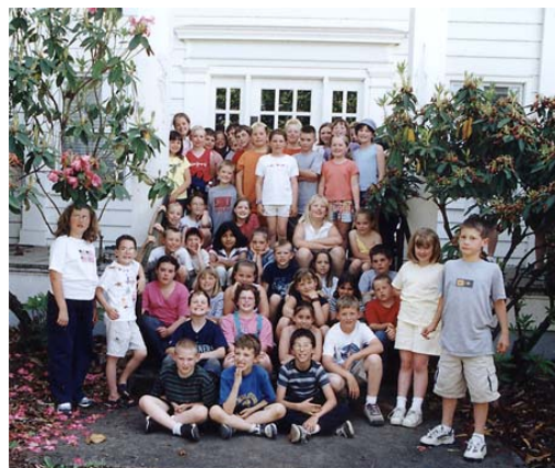
Students from Columbia Valley Gardens elementary school in Longview visit the White House.

During June of each year, several local elementary schools incorporate a Port tour into their curriculum. Longshore workers can be seen giving friendly waves to bright yellow school buses as they navigate through the terminals as students get an up-close look at dockside activities.