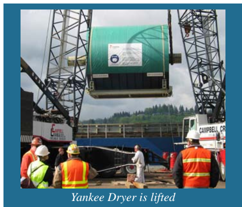
Yankee Dryer is lifted

Campbell Crane recently lifted a 143 metric ton "yankee dryer" onto Berth 8 using a shore-side heavy-lift crane. Once it was safely lifted onto the dock, the vessel was moved out of the